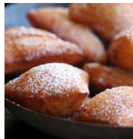
Displays, book tables and treats at our Pastor's Pancake Supper