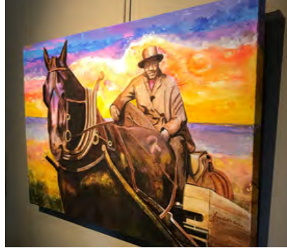
One of several pieces sold at the show